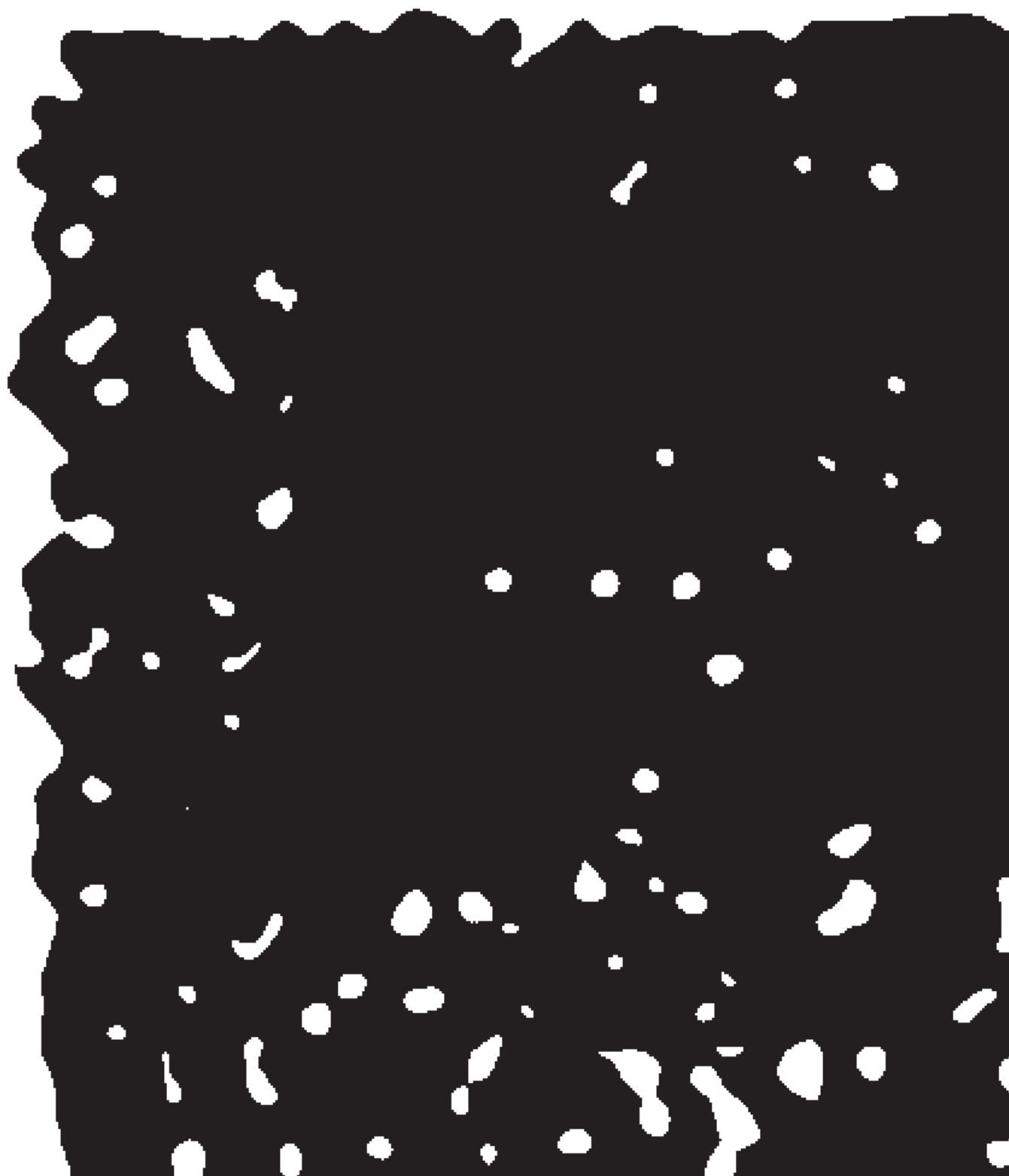
Pattern illustration 1:1