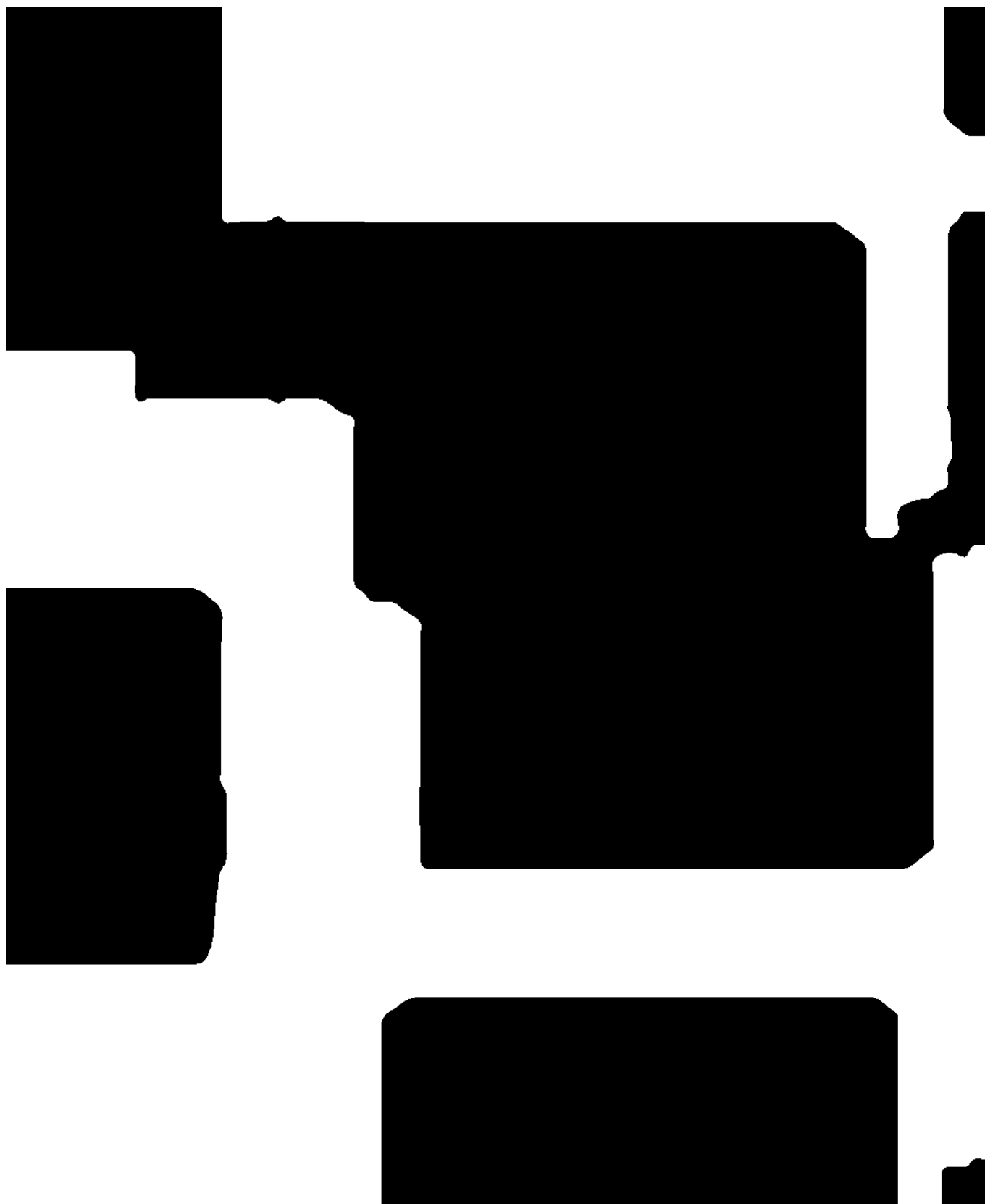
Pattern illustration 1:1