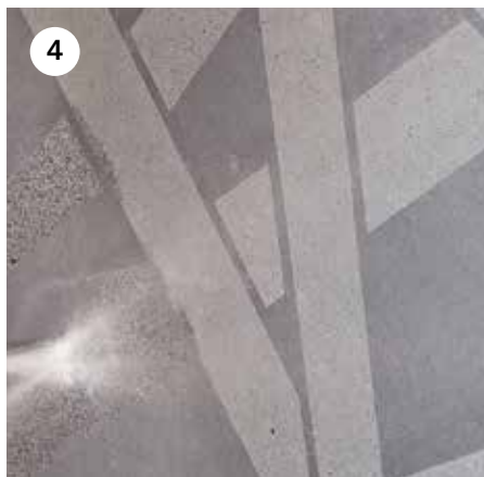
4 The slab is washed using a high pressure washer.