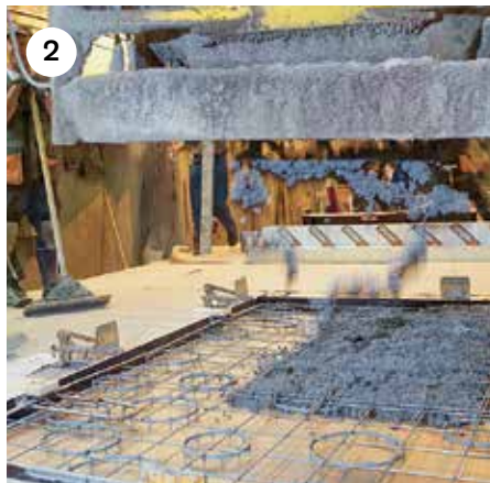
2 The mould is prepared and the slab is cast.