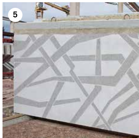
5 The end product is a patterned concrete element.