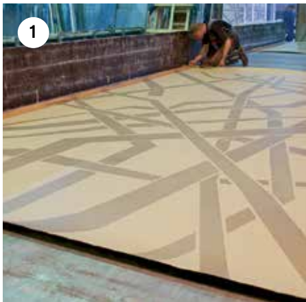
1 The Graphic Concrete membrane is spread on the mould table.