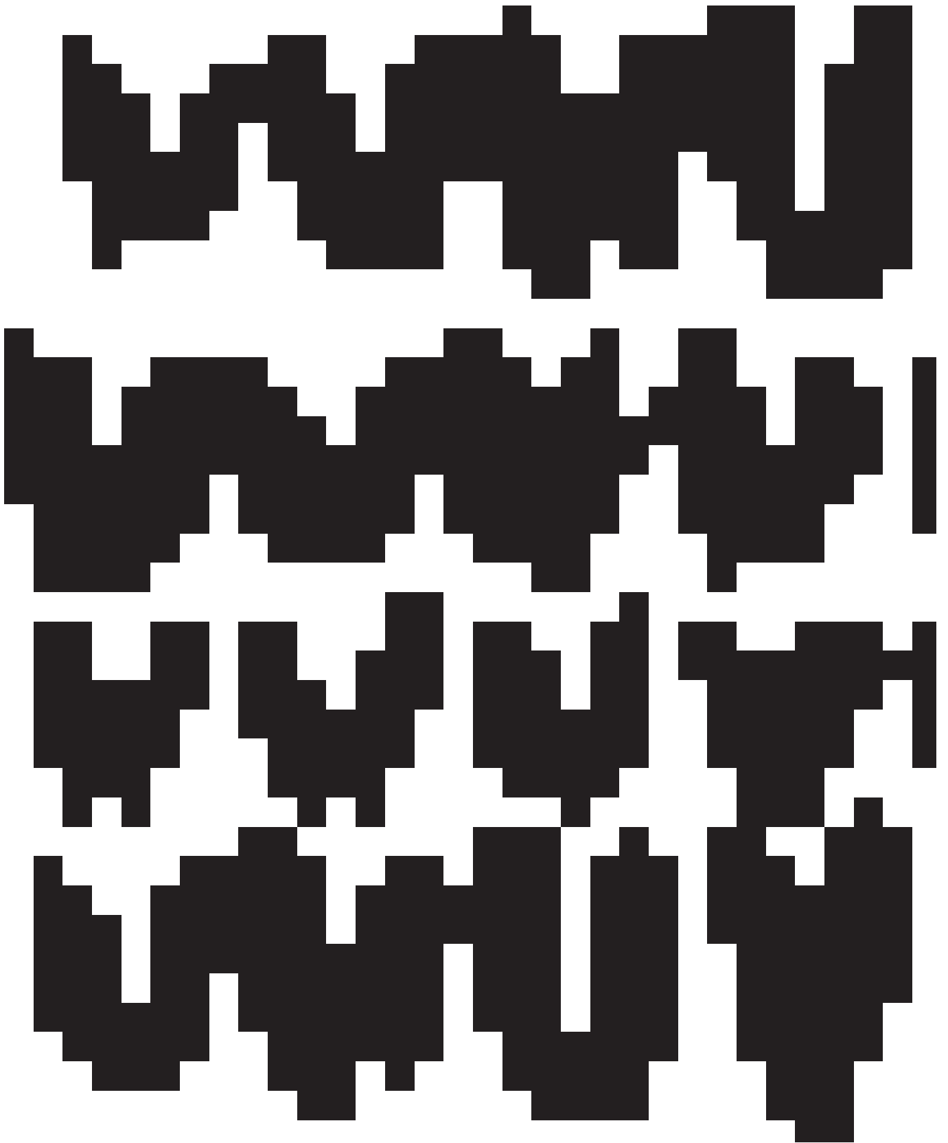
Pattern illustration 1:1